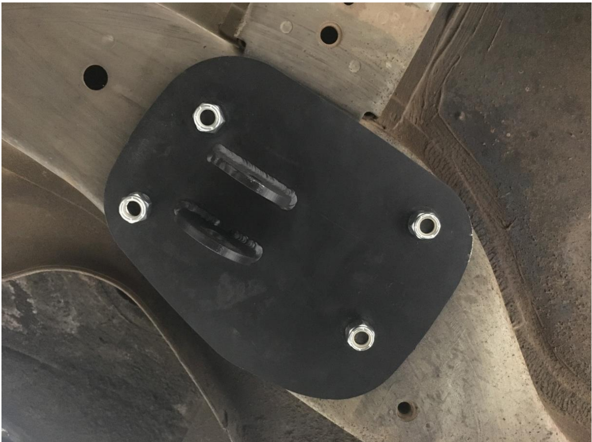
Place coil over mount plate on bolts from the top mount plate in boot, when bolting up ensure crush tube bottom out, this will cause the floor to re-shape itself once tight.