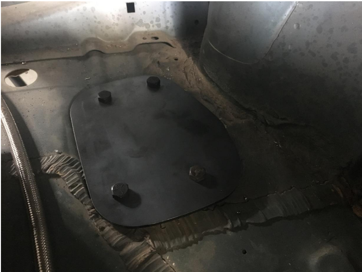
Place top plate in holes drilled in the boot