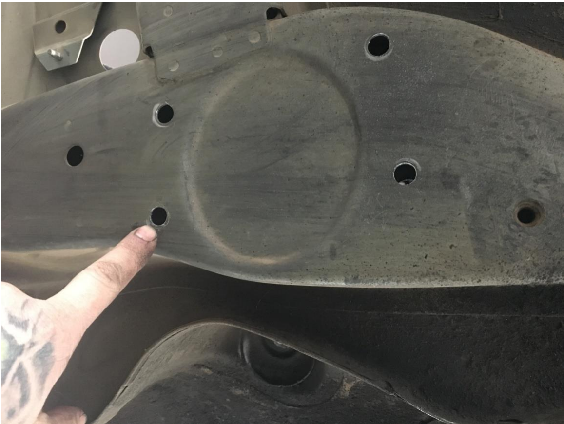
Standard holes in the rail are shown.