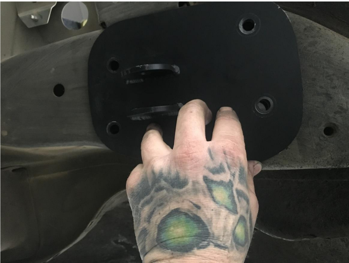
Hold Coil over mount plate up to align standard holes in the rails.