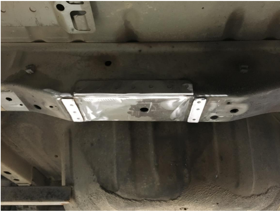
This photo shows the rail once diff mount has been removed.