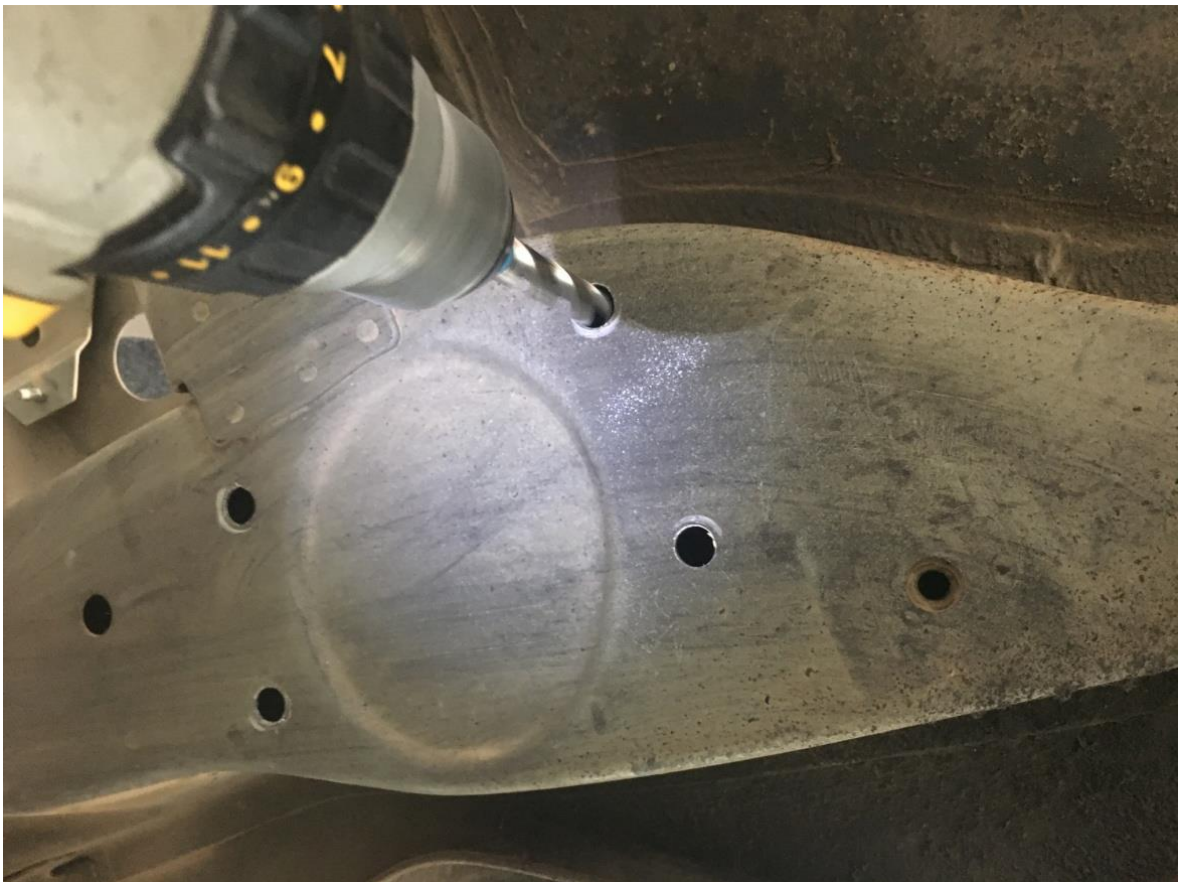
Drill holes all the way through using a 15mm drill, Making sure drill stays Square